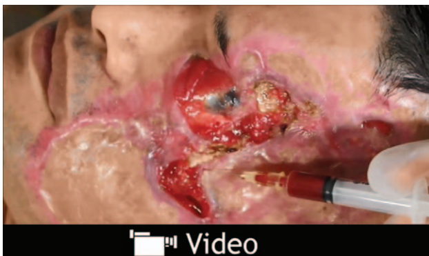
Video Graphic 1. See video, Supplemental Digital Content 1, which displays an injection into the surface of the ulcer of the medial region through a 30-gauge needle. This is performed once a week, http://links.lww.com/PRSGO/A281 .

A 61-year-old woman sustained a burn caused by heated oil to her left hand. She was diagnosed with a superficial second-degree burn of the fourth finger and third-degree burn of the fifth finger. She received debridement for the fifth finger on day 3 after injury, resulting in tendon exposure (Fig. 2A), and we began treatment using PFC-HA. After preparation in the same manner as described above, the weekly injection of 0.3 mL of PFC combined with 0.2 mL of non-cross-linked HA was performed into the wound surface of the fifth finger. After 2 sessions of treatment, the wound had almost completely closed, whereas the fourth finger healed with standard conservative treatment but left a hypertrophic scar (Fig. 2B).