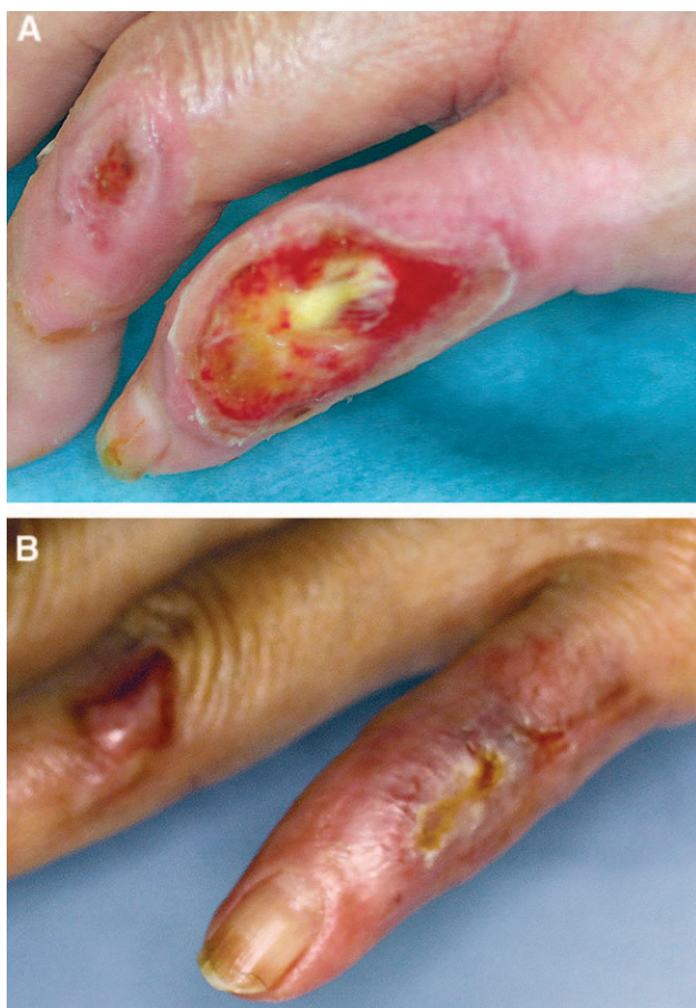
Fig. 2. A, Intraoperative view, after debridement on the third day after burn injury. The tendon on the extensor digiti minimi was exposed. B, Posttreatment view at 2 weeks. Two sessions of PFC treatment had almost completely healed the ulcer.

sumed to keep PFC around the ulcer and continuously releasing PDGF: as PFC is in a liquid form, its effects must be released slowly. 6 Although further evaluation is necessary, PFC–HA treatment is easy to apply, safe, and an effective choice to heal deep burn wounds that are intractable to conventional conservative treatment, and it may be promising for the treatment of refractory ulcers.